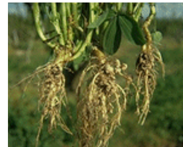
Sustainable Agriculture Research & Education, University of California, Davis