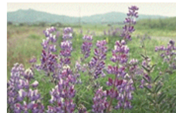
Sustainable Agriculture Research & Education, University of California, Davis