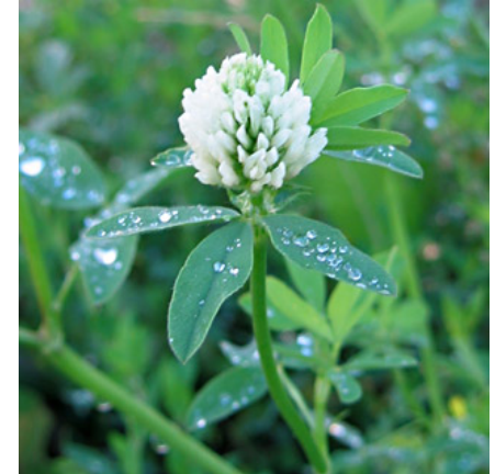
Wild Flowers of Israel, Trifolium alexandrinum