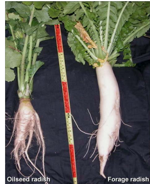
University of Maryland Extension, Fact Sheet 824