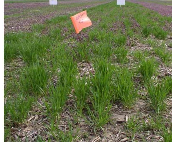
Midwest Cover Crops Council