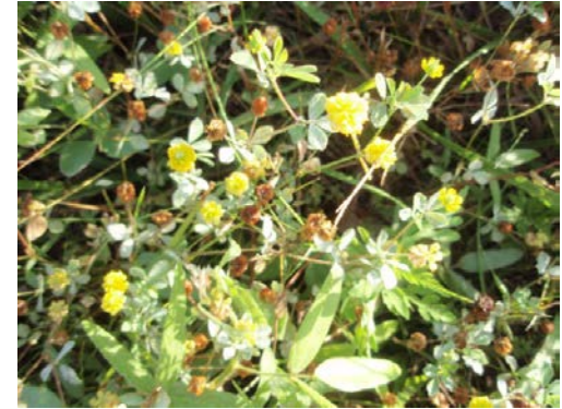
BLACK MEDIC Midwest Cover Crops Council