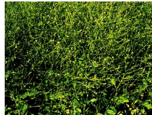
Crambe: USDA-ARS, NGPRL