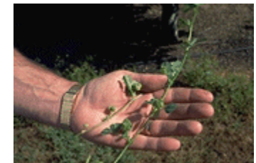
BURR MEDIC Sustainable Agriculture Research & Education, University of California, Davis