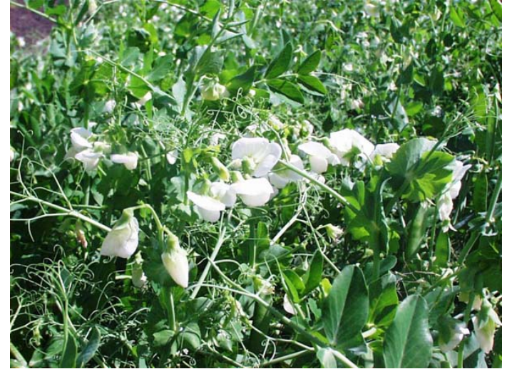
Midwest Cover Crops Council