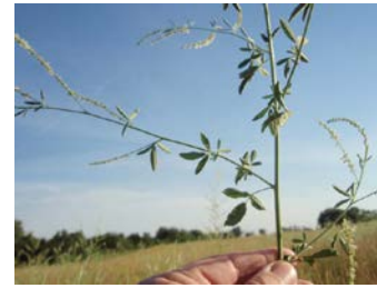
WHITE VARIETY Midwest Cover Crops Council