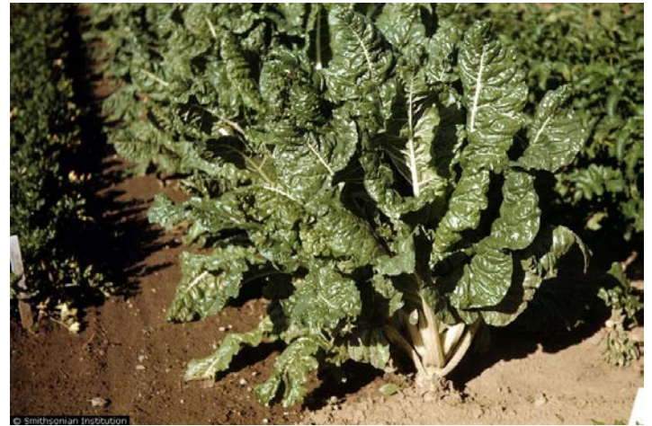
USDA, NRCS, PLANTS Database