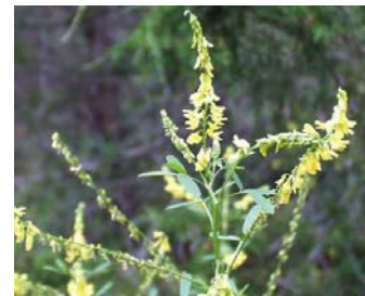
YELLOW VARIETY Midwest Cover Crops Council