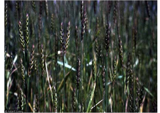
USDA, NRCS, PLANTS Database