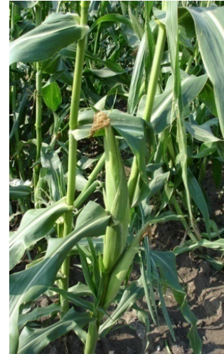
Midwest Cover Crops Council