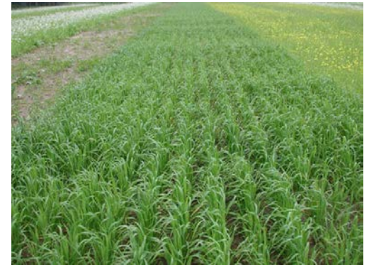
Midwest Cover Crops Council