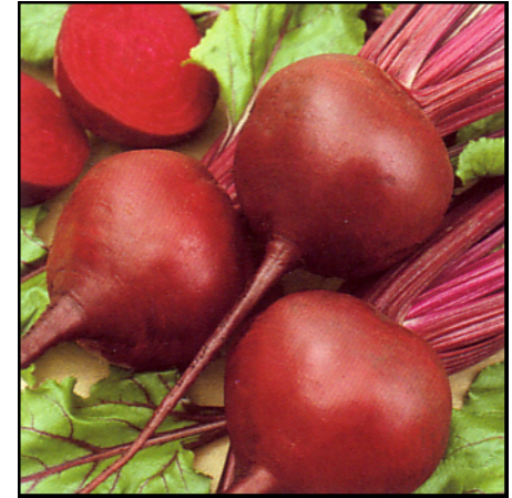
Augustus Oils Limited