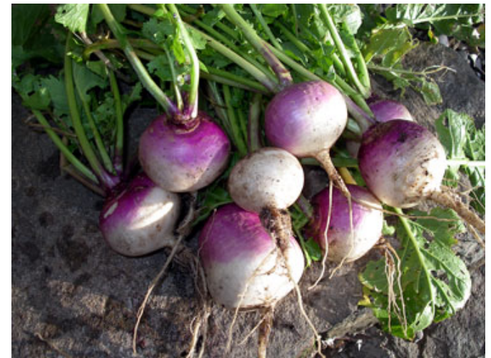
Mas du Diable, January 2009