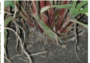
Midwest Cover Crops Council