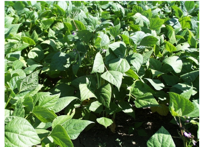
USDA-ARS, NGPRL, dry bean