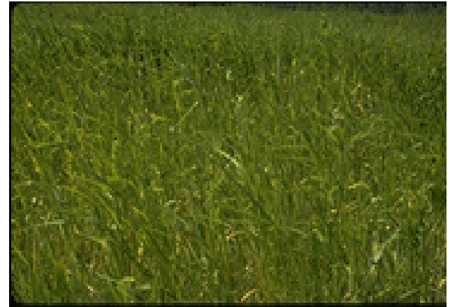
Sustainable Agriculture Research & Education, University of California, Davis