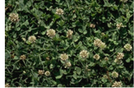
Sustainable Agriculture Research & Education, University of California, Davis