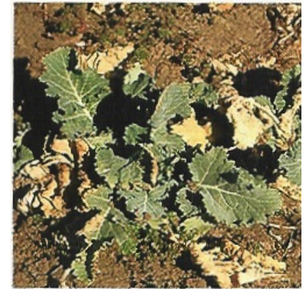
Canola Council of Canada