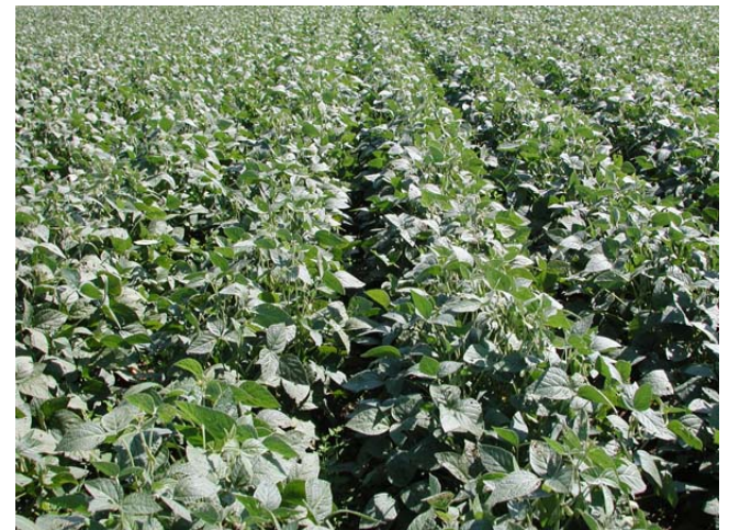
Midwest Cover Crops Council