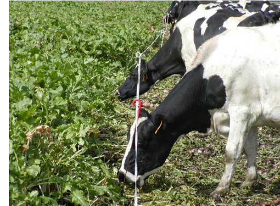
AMPAC Seed Company