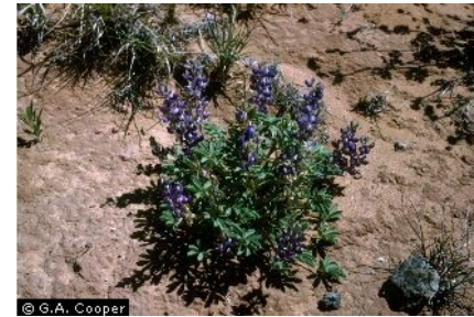
USDA, NRCS, PLANTS Database