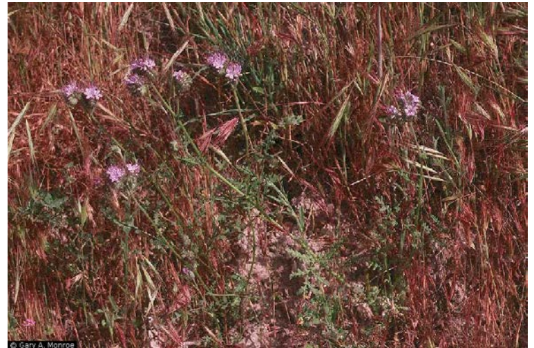
USDA, NRCS, PLANTS Database