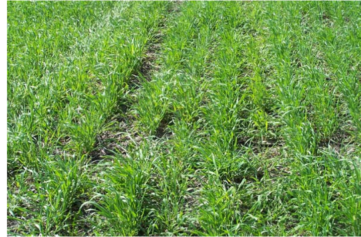
Midwest Cover Crops Council