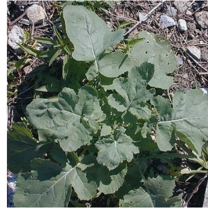
Midwest Cover Crops Council