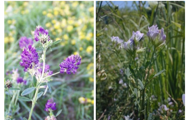
Midwest Cover Crops Council