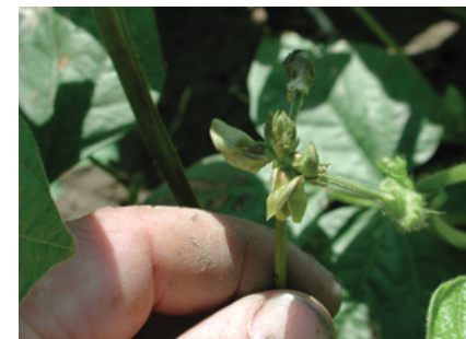
Top Crop Manager